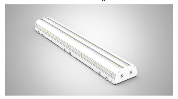
2. ALVA Decorative Housing (Shown here: Tex Wall