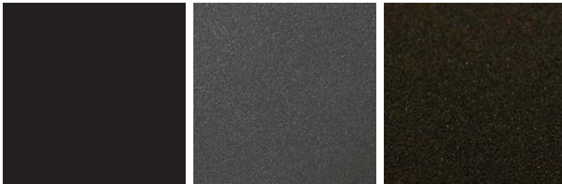
BLK - Black