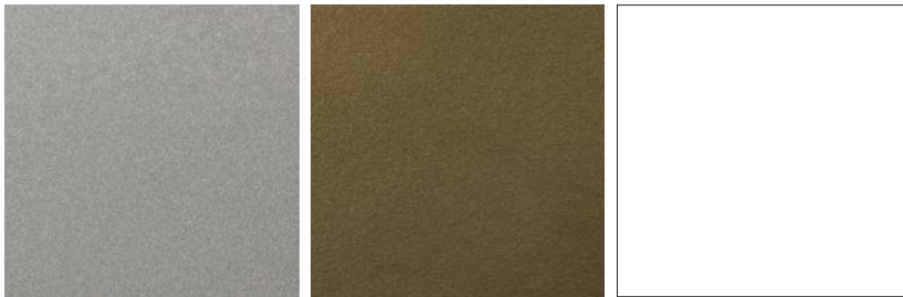
ESN - Enviro Satin Nickel