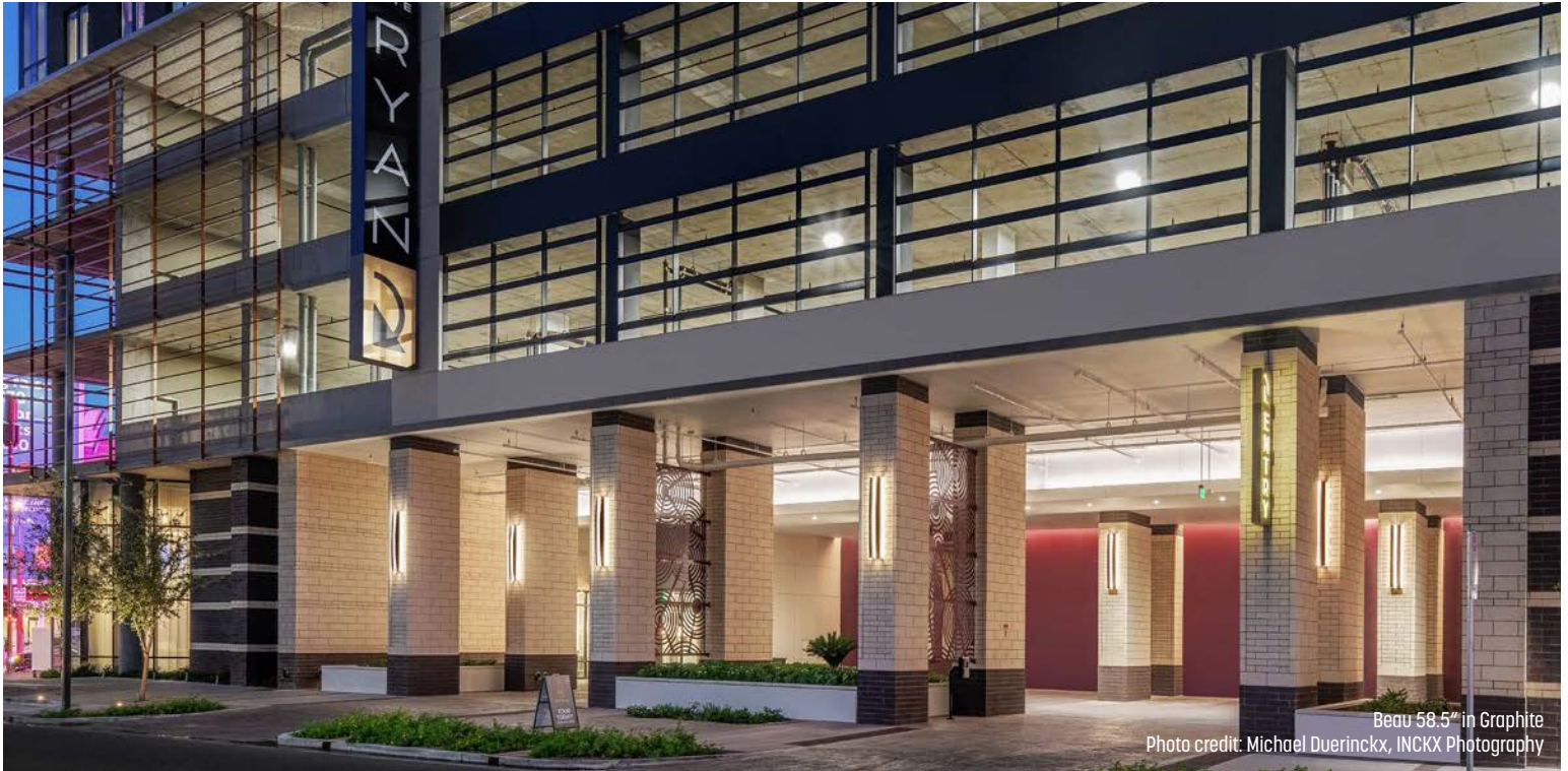
Beau 58.5" in Graphite